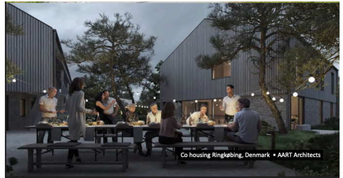
Co housing Ringkøbing, Denmark • AART Architects